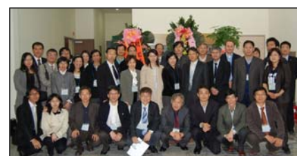
EASE Founding Assembly, Seoul National University, Oct. 31, 2007

5.4 In order to conduct the business of The Association, The Executive shall be empowered both to collect an Annual Membership Fee from personal and Organizational Members of The Association and to make applications to Fund-Awarding Bodies on behalf of The Association.